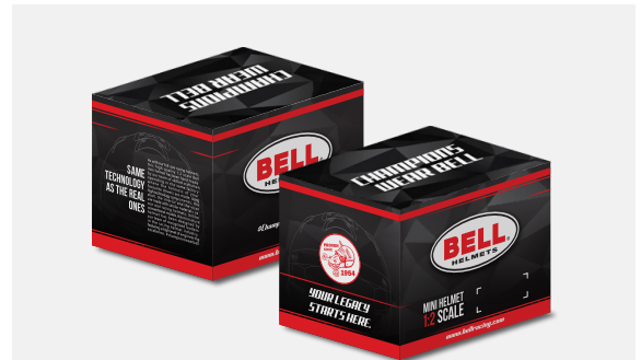
A. Sports Mini Line box