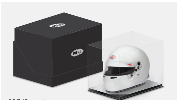
B. Bell box

95 EUR per piece 48 Pieces and above 45% discount